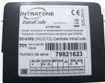
03-0102-EN: Central unit for 1 door and/or 100 names